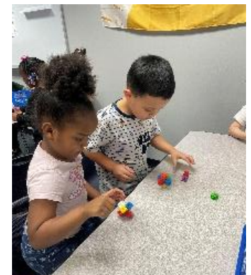
Designing a fidget spinner