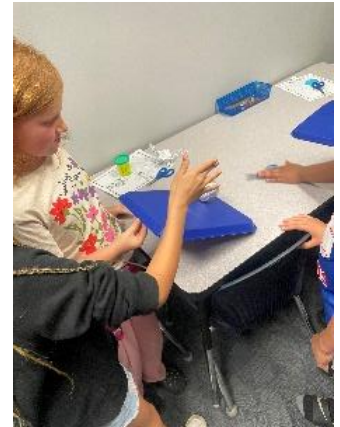
Rock rolling down a hill

Use this link for a list of library books that could link with STEM hands-on activities: https://www.amightygirl.com/books/general-interest/science-technology