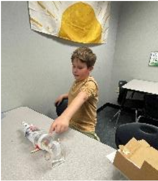
New toy prototype