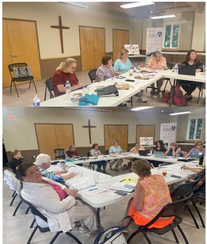
AAUW MO Board Meets for a Retreat and Board Meeting in Columbia on July 19.