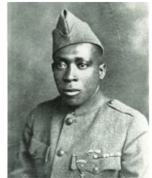
Sgt Henry Johnson