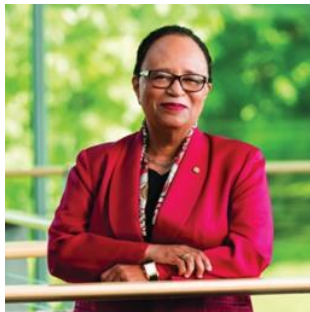
Shirley Ann Jackson PhD