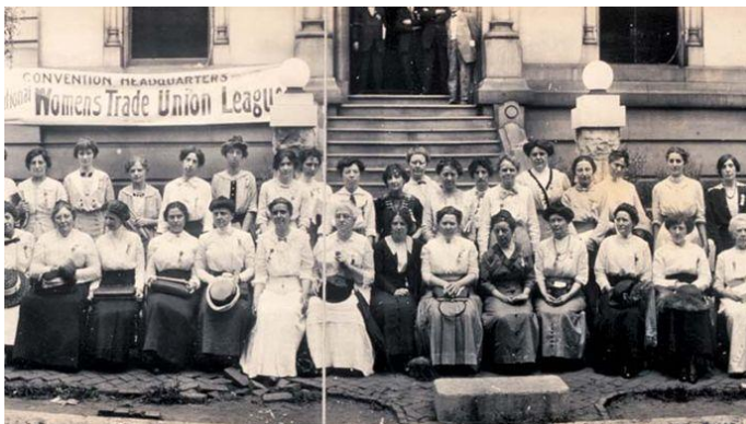
Women's Trade Union League (WTUL)