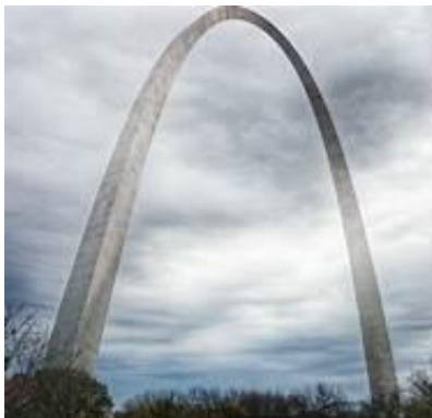
The St. Louis Arch