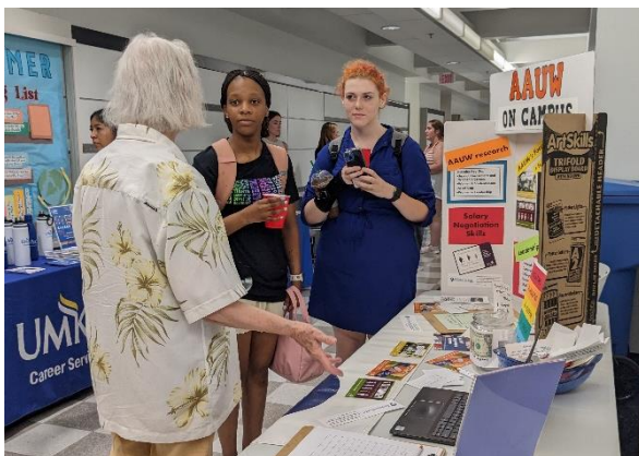
C/U members set up an information table at Missouri State University.