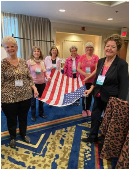
AAUW Flag ceremony begins conference and escorted by members of the regional planning team