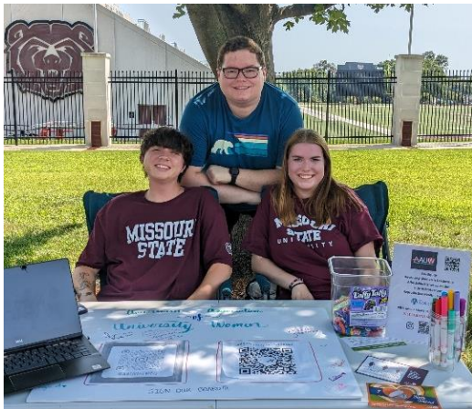
Officers of the AAUW student group at Missouri State University worked to their gain members at the Back to School Bash.

C/U members also set up information tables at Missouri State University and Columbia College. We hope to add these schools as members soon.