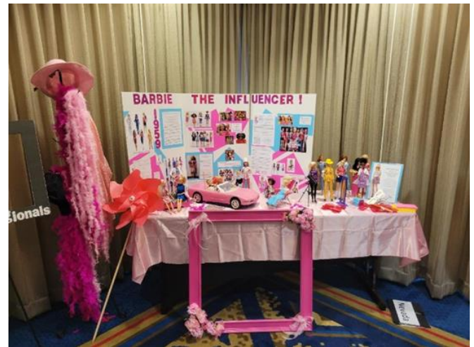
Barbie the Influencer display