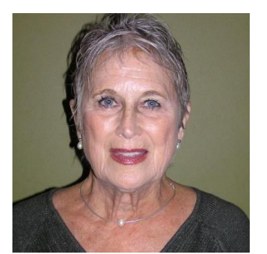
Alice Kitchens Public Policy Committee