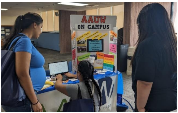
Campus Event at Kansas City Kansas Community College

Our committee's emphasis this year is to follow up with students and campus personnel to facilitate the formation of AAUW student groups. Our on-campus activity helps partner schools see the value in renewing their membership and helps us demonstrate the appeal of AAUW to potential member schools.