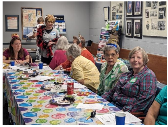
On July 31, our branches celebrated our new program year with snacks, tiaras, games, and New Year's decorations. We gave new member orientation and members signed up for committees. We had a great turnout, and two new members took advantage of the Shape the Future program at that event and joined the KC Northland Branch!

The KC Northland and Parkville Branches had a wonderful evening at our Happy Hour event at Trezo Mare restaurant on June 8. We celebrated our branches' 10–Star Achievements from last year and recognized our incoming officers. Best of all, each branch awarded our free national memberships earned through the Shape the Future Program last year. We welcomed six new members--three to each of our branches!