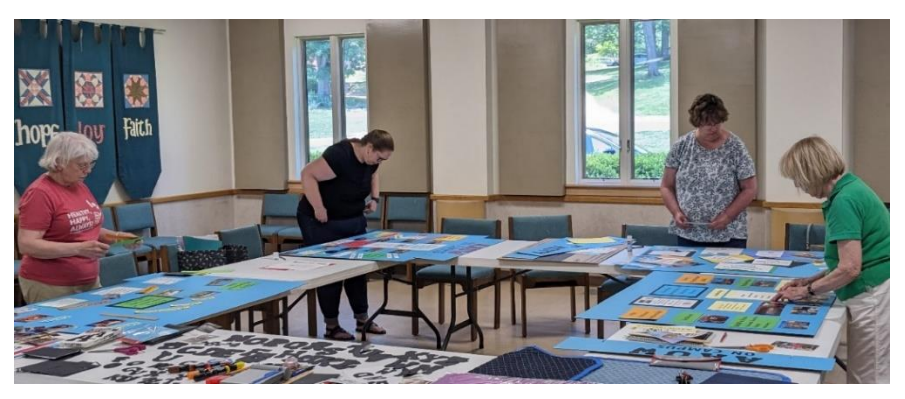
AAUW members make signs for upcoming campus visits state-wide.

The C/U committee has had a busy summer getting ready for a new year of campus events. To prepare, the committee held two workshops to create AAUW displays on college campuses. We now have ten displays in different areas of the state, ready to help us tell college students about AAUW.