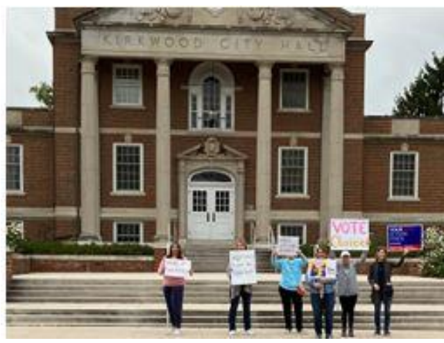
KWG Branch's VOTE yard sign at Kirkwood City Hall as part of a demonstration for women's right to choose.

Is Your Voice," is still available for sale. Contact the Branch for