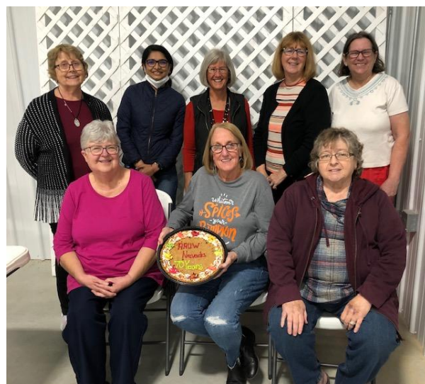
Nevada Branch members celebrate 70th anniversary.

Many students are continuing with online learning, so fewer students were available. We work in conjunction with the Jackson County Election Board twice a year to offer this opportunity.