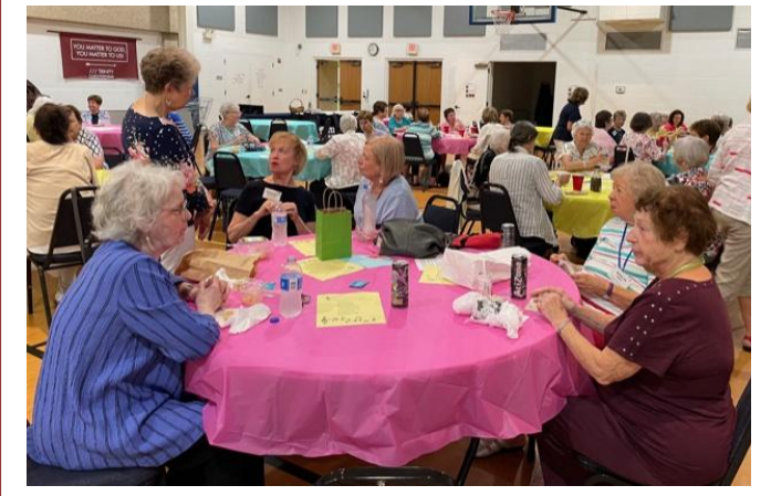
B-C members enjoy summer camaraderie.