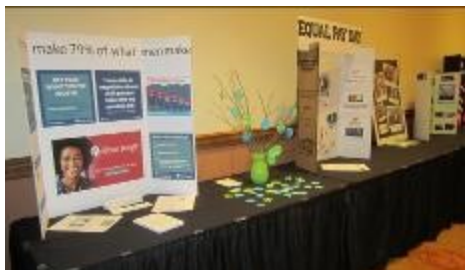
Branch exhibits at state conference highlight activities.

On April 27th and 28th a tabling event was held at the Earth Day Festival in Forest Park. Branch members, as well as members from other branches, manned a booth in the rain (early Saturday) and wind. AAUW literature was available for interested people, some of whom signed our list for follow up. Bookmarks were handed out containing information on AAUW's free, online, Work Smart workshop. Four branch members attended the annual meeting on May 3-4 in Columbia.