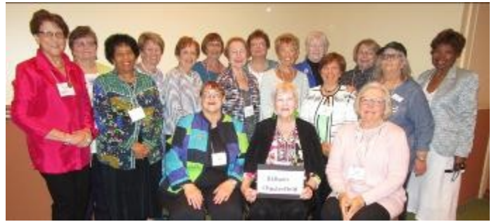
Ballwin-Chesterfield Branch - First place in Total Giving and Fourth Place in Per-Capita Giving ($50.73)

Independence Branch — Scholarships for High School and Middle School Girls