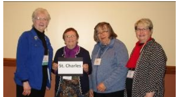
St. Charles Branch - Second place in Total Giving and First Place in Per-Capita Giving ($76.02)