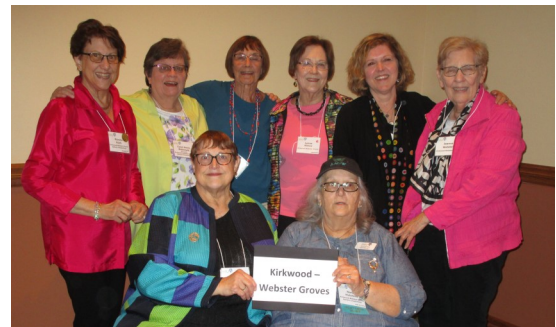
Kirkwood-Webster Groves Branch - Third Place in Total Giving and Second Place in Per-Capita Giving ($69.64)