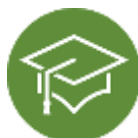
Education & Training