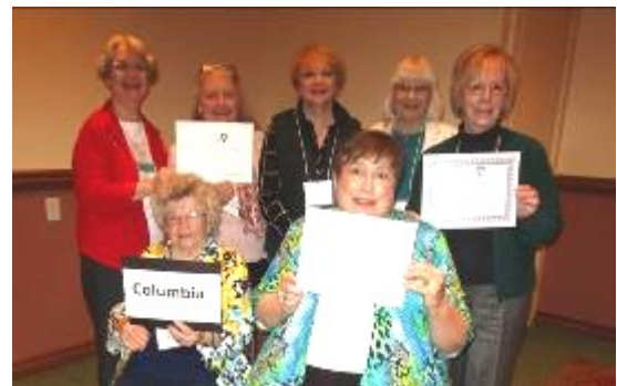
Columbia Branch—Fourth Place in Total Giving and Third Place in Per-Capita Giving ($68.17)