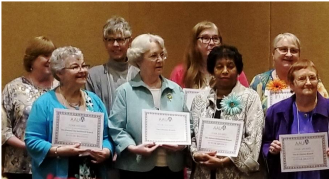
KC Northland is one of 10 Star Awardees.