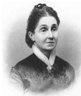
Virginia Louise Minor 1824-1894

In the mid-1800s, Virginia Louisa Minor was a woman with a mission - - she wanted to vote! After the passage of the Fourteenth Amendment in 1868, Minor stated that "the Constitution of the United States gives me every right and privilege to which every other citizen is entitled."