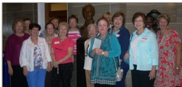
AAUW MO members welcome Virginia Minor to the State Capitol (statue in back of group)